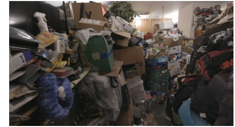
CIR = 9