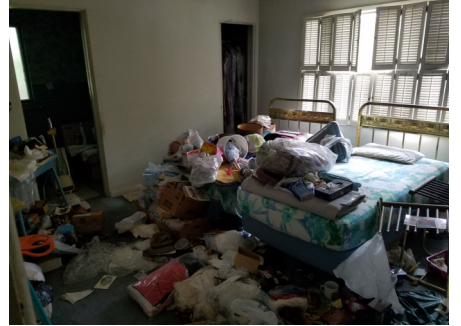
CIR = 3