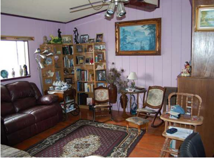
CIR = 1