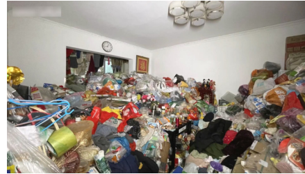
CIR = 8