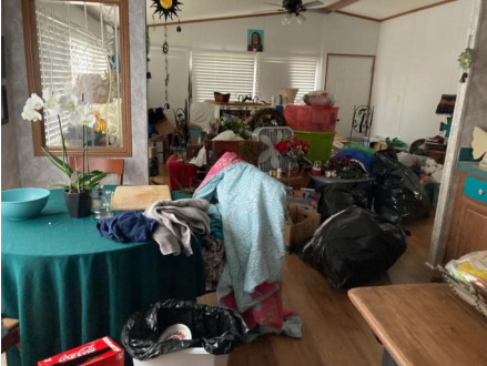
CIR = 4