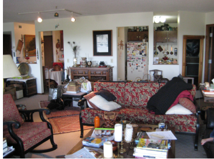
CIR = 2