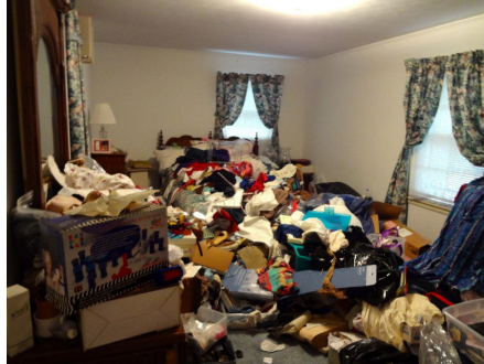
CIR = 5