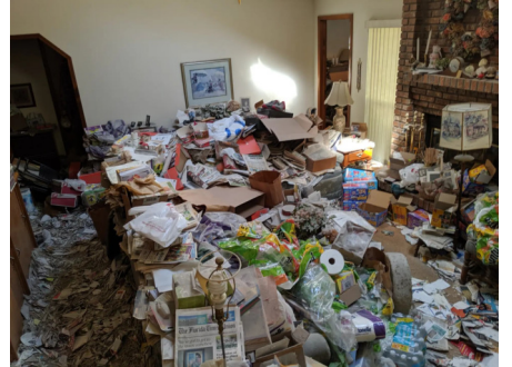
CIR = 6