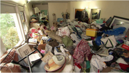
CIR = 7